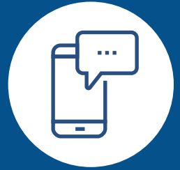
Social Media Engagement